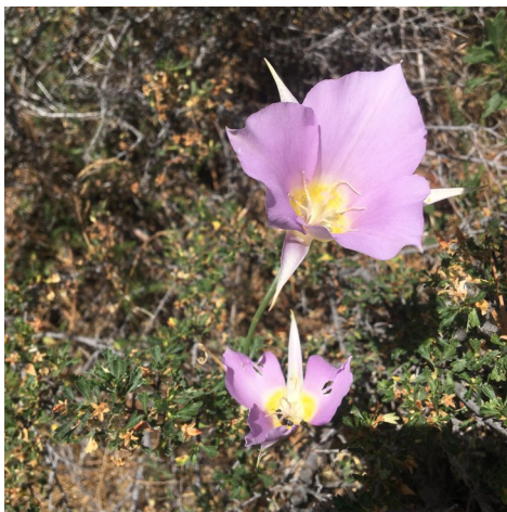
Sagebrush mariposa lily