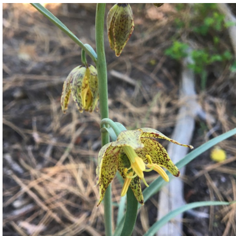
Checker, leopard or chocolate lily