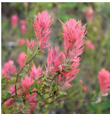
Giant red paintbrush