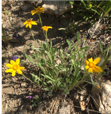
Common woolly sunflower