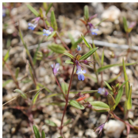
Small-flowered blue-eyed Mary