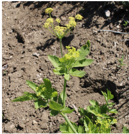
Western sweet cicily