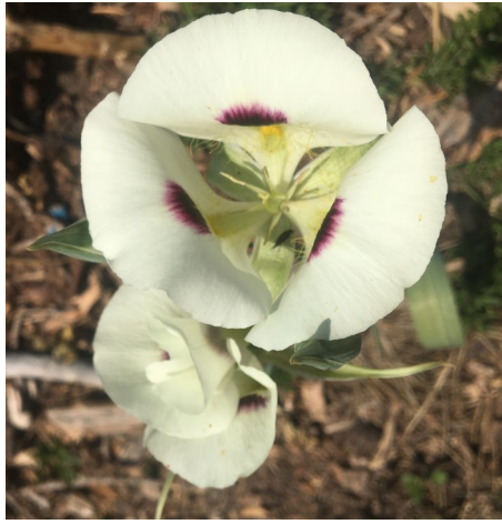
White mariposa lily