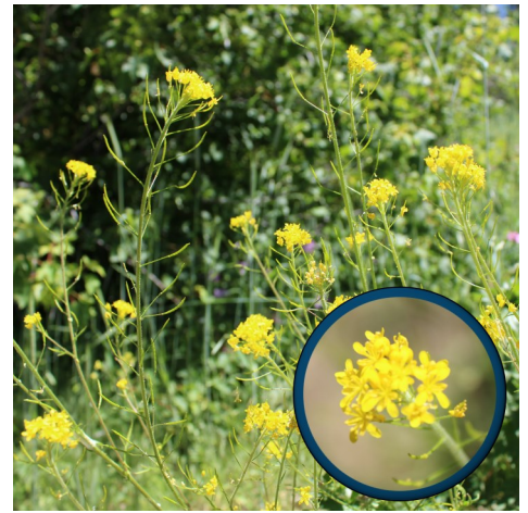
Western tansy mustard