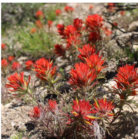
Rocky mountain paintbrush