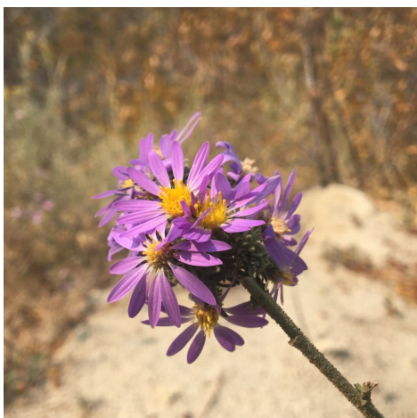
Hoary tansy aster