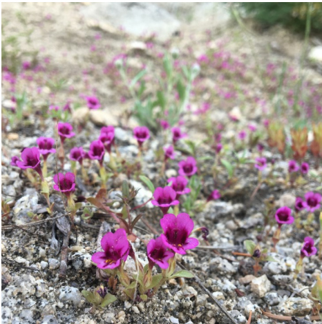
Dwarf purple monkeyflower